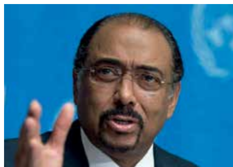
Mr. Michel Sidibé Executive Director, UNAIDS and Under Secretary-General of the United Nations

Led by the Global Fund to Fight AIDS, Tuberculosis and Malaria, in collaboration with African strategic partners