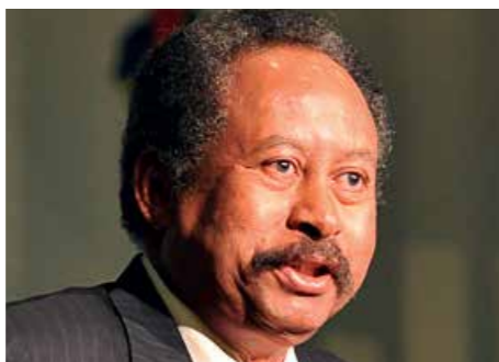
Dr. Abdalla Hamdok Deputy Executive Secretary, Economic Commission for Africa

Mr. Sidibé was appointed Executive Director of UNAIDS and Under-Secretary-General of the United Nations in 2009. Mr Sidibé previously worked as Country Director for Terre des Hommes, and oversaw programmes across 10 francophone African countries as country representative for UNICEF. Michel Sidibé holds two post-Master's Diplomas – in Social Planning and Demography and Development and Political Economy – from the University of Blaise Pascal, Clermont-Ferrand, France, and a Master's degree in Economics.