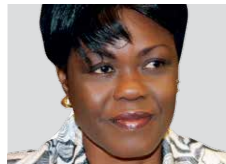
H.E. Ms. Kaba Nialé Minister to the Prime Minister in charge of Economy and Finance, Côte-d'Ivoire

H.E. Ms Kaba Nialé is the first woman in an Ivorian Government, as Minister to the Prime Minister in charge of Economy and Finance, Ms. Nialé Kaba holds a Master of Economics degree, with a specialty in Public Economics, obtained from the University of Abidjan in 1985. A Statistician and Economist Engineer, she obtained a postgraduate diploma (DEA) in International Economics at the CESD of Sorbonne University and is a graduate of the IMF Institute in Economic Policy Management.